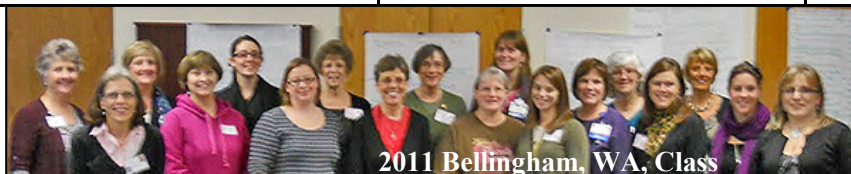
2011 Bellingham, WA, Class